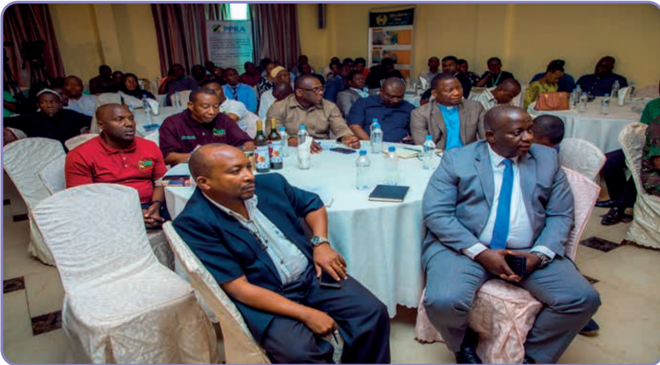
Participants follow a presentation by PPRA on preference scheme, during Clouds TV Regional Breakfast program from Mtwara recently.